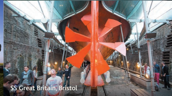
SS Great Britain, Bristol