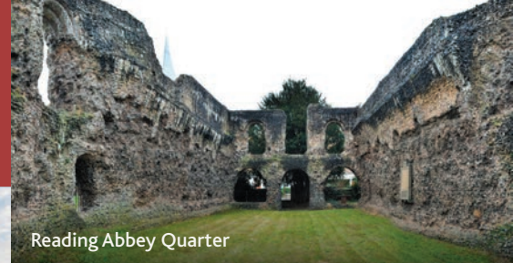
Reading Abbey Quarter