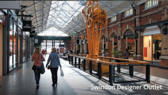
Swindon Designer Outlet