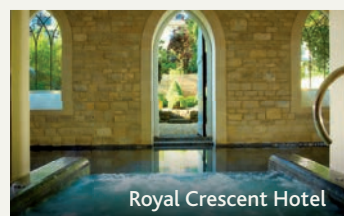
Royal Crescent Hotel