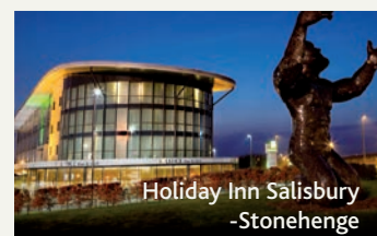
Holiday Inn Salisbury-Stonehenge