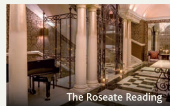
The Roseate Reading