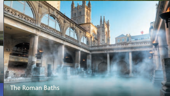
The Roman Baths